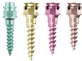
Colour coded anodising of the surface.

Like other innovative procedures, the application of TADs can be initially rejected by the clinician, who may consider it complex and unnecessary. The course is intended to illustrate the advantages and disadvantages of TADs, their features and benefits, simple clinical procedures, as well as the possible risks and complications. Our goal will be to increase the knowledge and confidence of the clinical application of TADs, through the analysis of different clinical situations, as well as by applying TADs on blocks of synthetic bone.