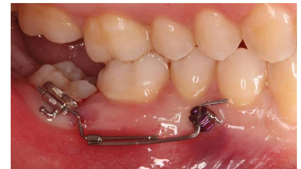
Molar up-righting spring for direct pin anchorage