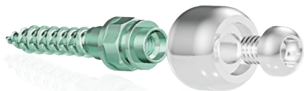
OrthoEasy® Pal – the palatal pin.